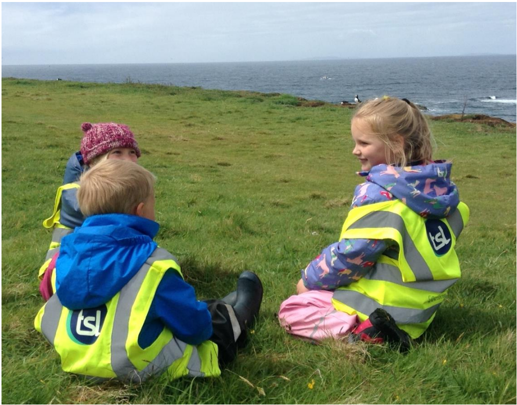
We thoroughly enjoyed our joint school trip to Staffa and Lunga to see the puffins.