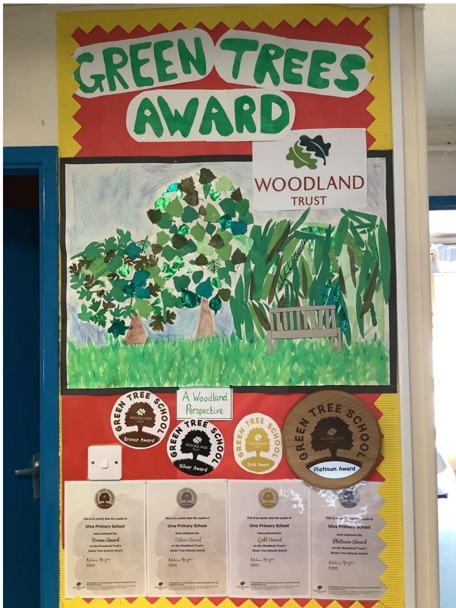
We were delighted to be awarded the Woodland Trust Green Tree School Platinum Award this year.

The online assessment system will produce feedback information about where your child did well and where further support is required. Your child's teacher will use this feedback to help plan next steps and provide further support as appropriate. Providing the right support at the right time will help to ensure your child can reach his or her potential.